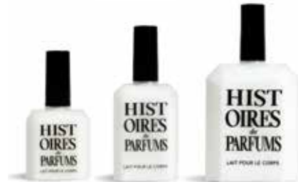
BODY LOTION 1969

35 ml / 1,18 fl. oz 50 ml / 1,69 fl. oz 100 ml / 3,38 fl. oz