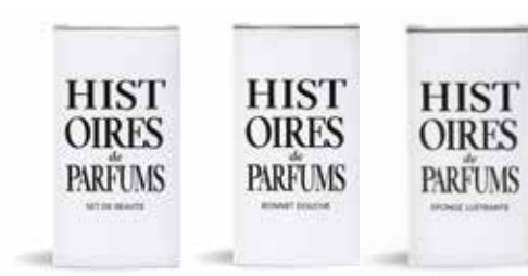
FLAT RECTANGULAR BOX