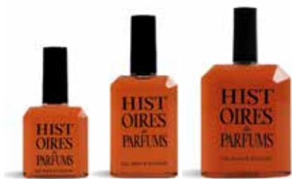
SHOWER GEL 1969

BASE NOTES: Patchouli, Chocolate, Coffee, White Musk