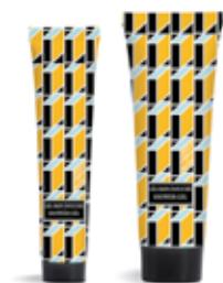
SHOWER GEL 1969