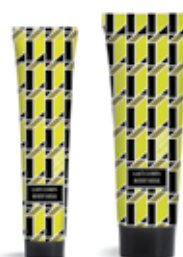
BODY LOTION 1969